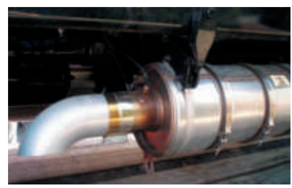
Three-Way Catalyst Aftertreatment

The ISL G is capable of operating on compressed or liquefied natural gas (CNG, LNG). The ISL G can also operate on up to 100% biomethane – renewable natural gas made from biogas or landfill gas that has been upgraded to pipeline and vehicle fuel quality. Biomethane fuel is carbon dioxide (CO<sub>2</sub>) neutral and using it as fuel reduces vehicle greenhouse gas emissions by up to 90%.